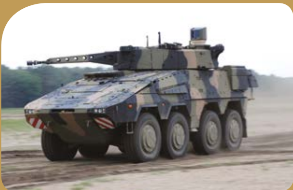
Rheinmetall Boxer CRV