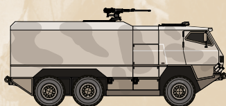
Complex Weapon System