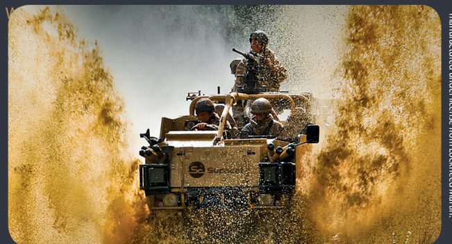
The Supacat HMT Vehicle is designed by Supacat and manufactured under license from Lockheed Martin.