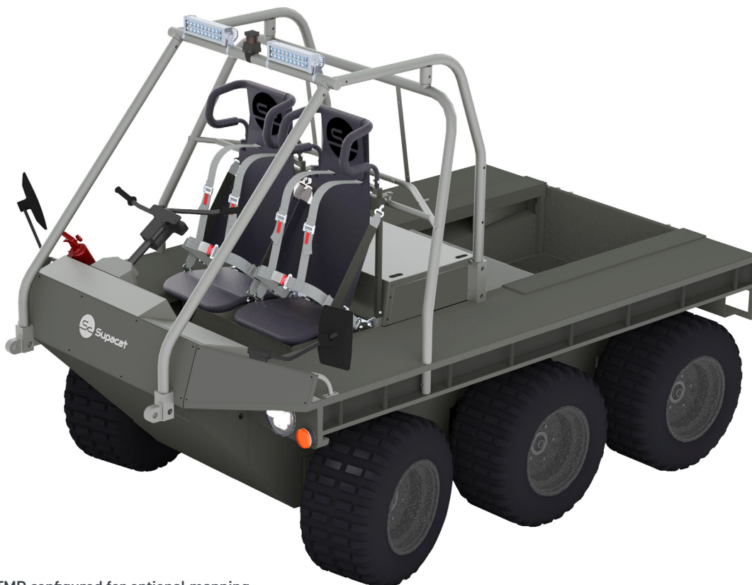
ATMP configured for optional manning